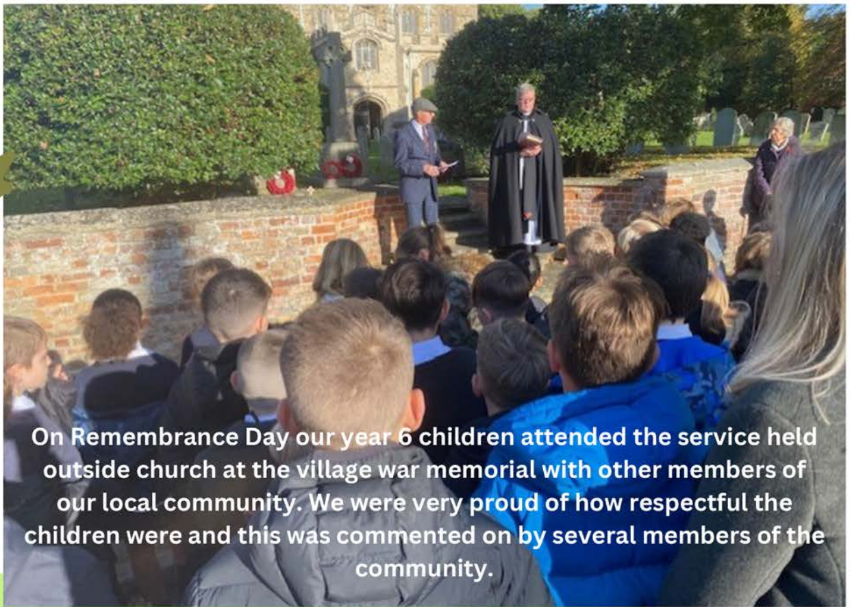
On Remembrance Day our year 6 children attended the service held outside church at the village war memorial with other members of our local community. We were very proud of how respectful the children were and this was commented on by several members of the community.